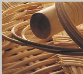
Hand-woven 100% Natural Mature Rattan Vine