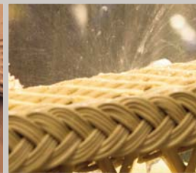
Sealed and Finished Weather-Resistant Weaves