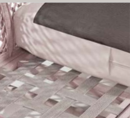
Patented Drain Through Cushion System