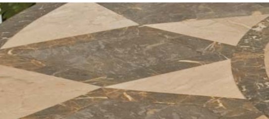
Stone Top detail: Chestnut & Snakeskin